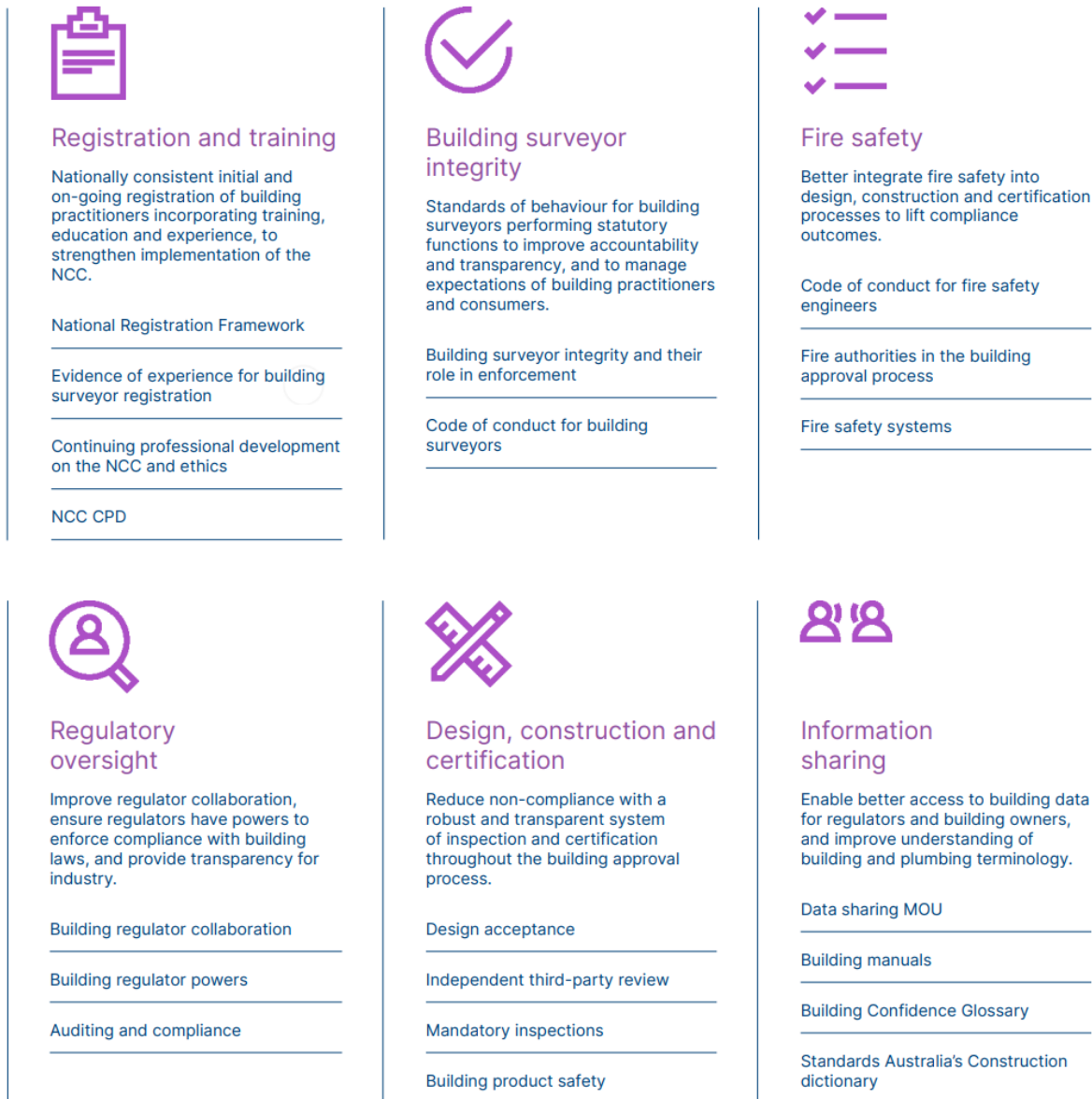
Figure 1: Building Confidence Implementation Framework - Outputs